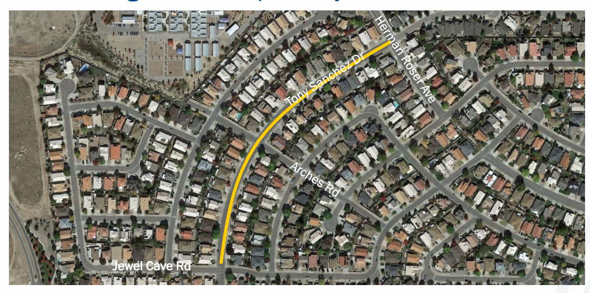
Wilson & Company, Inc., Engineers & Architects